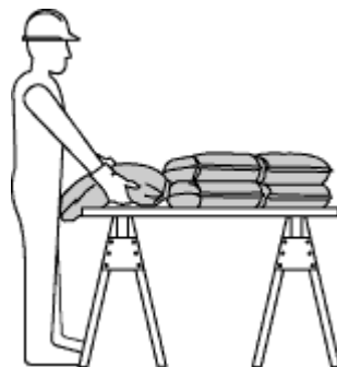
Store bags at waist height